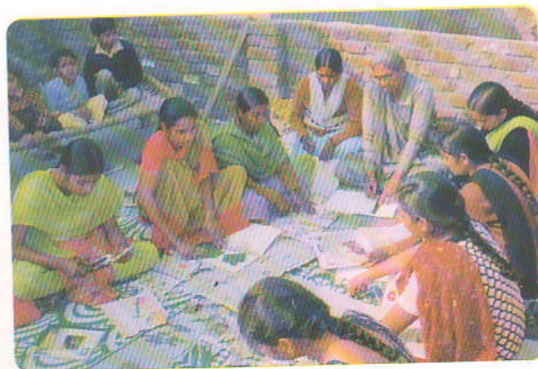
Tailoring, Stitching & Embroidery Training (Kampilye)